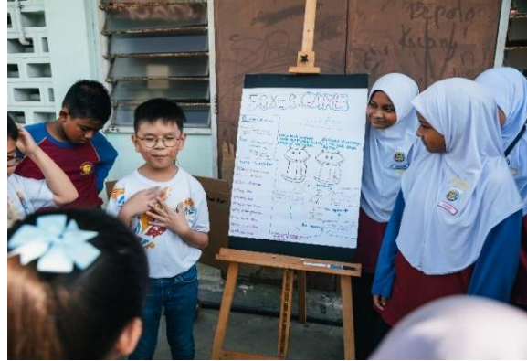
Participants presenting their innovated game – ‘Musang dan Ayam’ – to students from other schools.