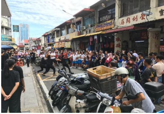
After a tour showing how they extracted moves from vendors, physical theatre students put on a street show at Chowrasta Market.