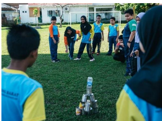
Participants demonstrating (peer-coaching) their innovated games to other participants (WaWaWarisan)