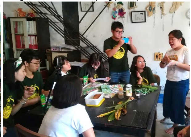
Exchange and sharing with heritage ambassador from Taiwan Alishan Youth Ambassadors

Refer to Appendix 1 for the list of network and exchange in 2019 Refer to Appendix 3 for the list of media coverage 2019