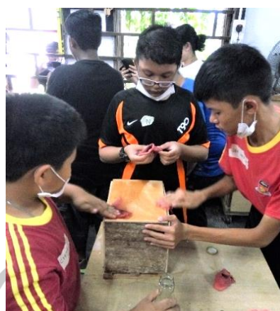
Working together to build a 2-in-1 wood product, a stool, and a storage box, using recycled wood (School of Craft)