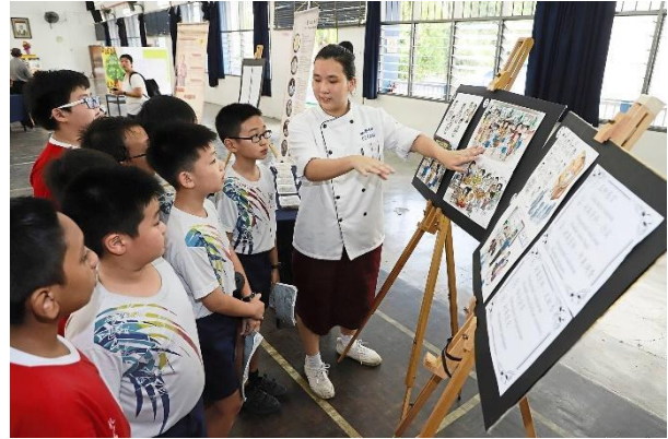
Participant from 'The Cooking Sauce' project explaining the process of fermentation of soya sauce to student visitors

See the full evaluation report of Training Programme for Local School Teachers in Designing and Implementing Place-based Learning (PBL)