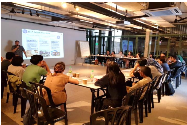
Arts-ED is one of the members of creative hubs of Malaysia under Hubs for Good programme initiated by British Council

In the areas of: Youth engagement in heritage, creative arts and cultural heritage education and community engagement, cultural mapping, and global citizenship