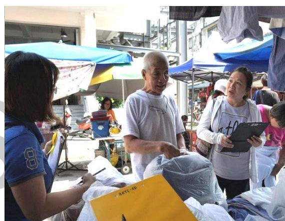
Teacher mapping the local resources available to further plan their project according to the subject they teach

7 schools successfully underwent training and 6 schools continued to plan, design, and execute their cultural heritage projects using the Place-based Learning (PBL) method.