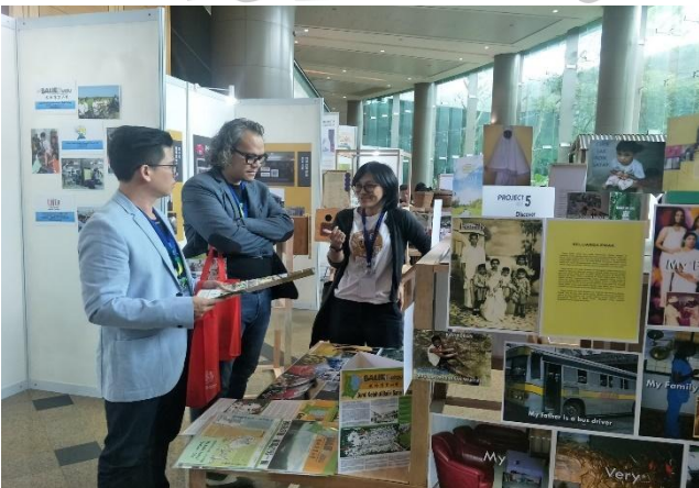
Exhibition at Convention of Majlis Pengurusan Komuniti Kampung (MPKK)