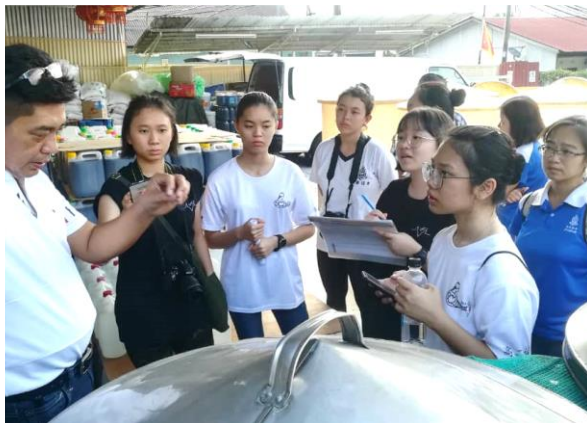
Teacher coaches students who are having their first try at interviewing the soya sauce factory owner at Hong Seng Estate (My Cooking Sauce)

This is one of the sustainable strategies in advocating cultural heritage promotion which empower teachers with know-how to continue the effort independently. These schools took the lead in developing cultural heritage projects in their schools – a step forward in moving to sustainable cultural heritage education.