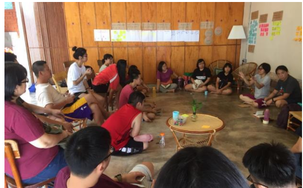
Experience sharing by various community and cultural workers from different parts of Malaysia