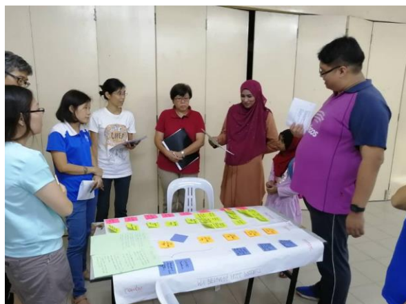
Teachers planning the programme sequences and creative activities

Number of participating teachers: 12 | Number of schools: 3 SMK Air Itam, SMK Abdullah Munshi, Penang Chinese Girls' Private High School