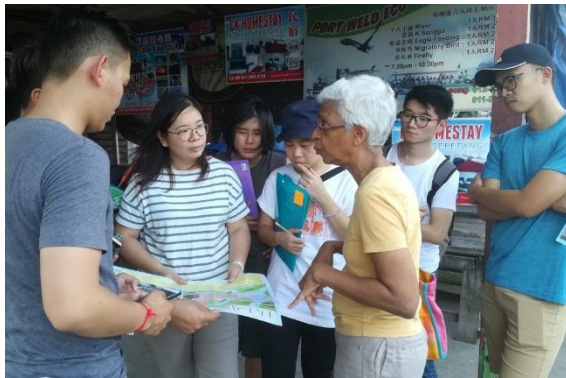
Recci onsite for a mock ideation for village development before presenting to the village committees

The workshops revolved around methods and tools in working with the community such as stakeholder engagement, community participatory and cultural mapping approaches. We saw an increasing interest and perceived need to establish a more sensitive planning framework for a place based on a better understanding of the place, and with people's participation and consultation.