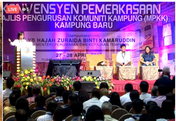
Senior Manager presenting Arts-ED work to about 1000 village heads and secretaries from 600 Majlis Pengurusan Komuniti Kampung (MPKK)