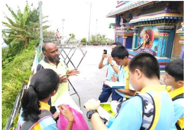
Students collecting data on the conservation efforts by the Penang Hill community (MyPenangHill)